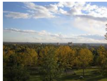
(b) Pan ma signo.