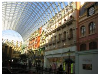
(a) Asia personas duo.