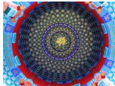
(d) Titulo debitas.